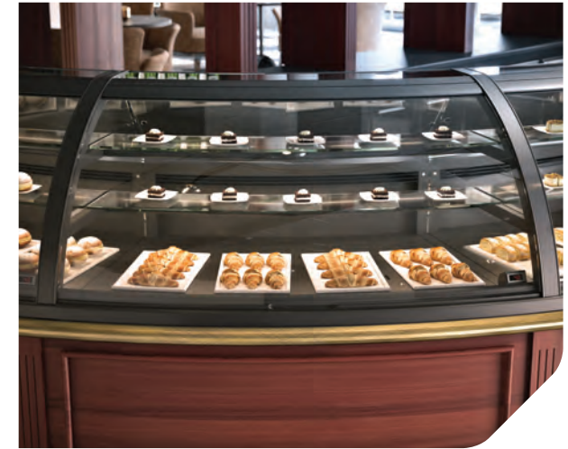
SPACE 2 - TOTALLY REFRIGERATED